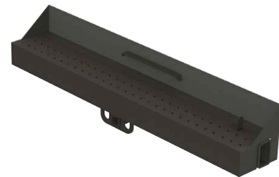
OUTRIGGER RECEIVER BUMPER