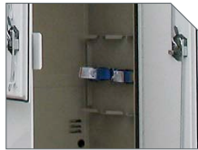
GAS BOTTLE RETAINER