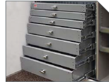
STEEL MECHANIC DRAWERS