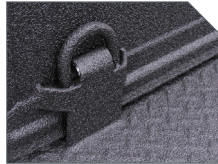
CARGO TIE DOWNS