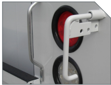
MASTER LOCKING SYSTEM