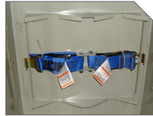
BOTTLE GAS RETAINER