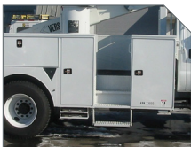
SIDE ACCESS STEPS