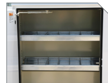
SHELVING AND DIVIDERS