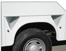
WHEEL CHOCK HOLDERS