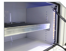
LED COMPARTMENT LIGHTING