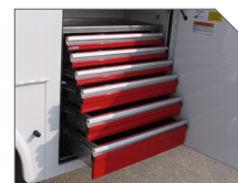
ALUMINUM MECHANICS DRAWERS