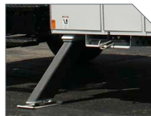
OUTRIGGER PAD CARRIERS