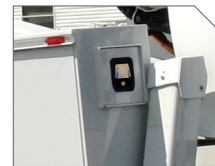
REAR ACCESS DOOR AND FULL LENGTH SHELF