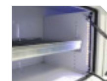
LED COMPARTMENT LIGHTS