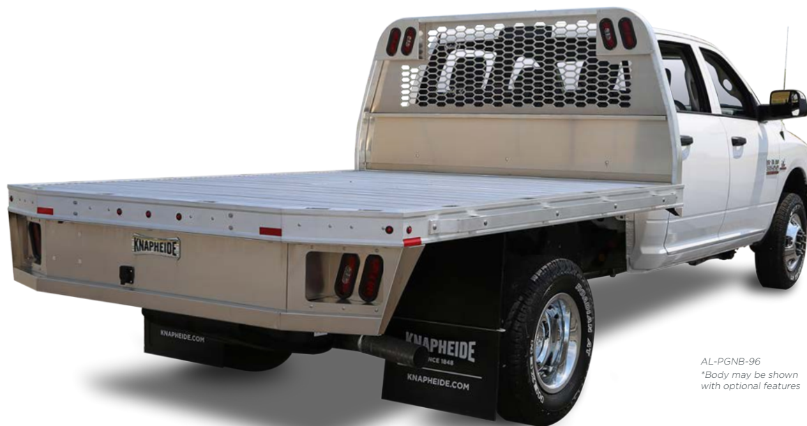
AL-PGNB-96 *Body may be shown with optional features

The Knapheide Aluminum Gooseneck features aerospace technology assembly utilizing military-grade aluminum extrusions. What does this mean? This means a rugged work body that is 40 percent lighter than steel to provide more payload for the haul. With a gooseneck hitch system rated at 30,000 lbs. you can rest assured that this aluminum flatbed can handle your heaviest of loads. The aluminum construction gives you better protection against corrosion ensuring your aluminum truck bed will last for years to come.