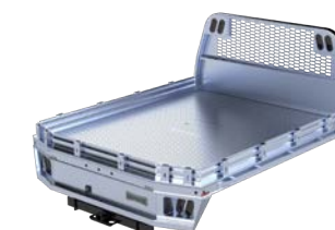
ALUMINUM 6" HIGH SIDES